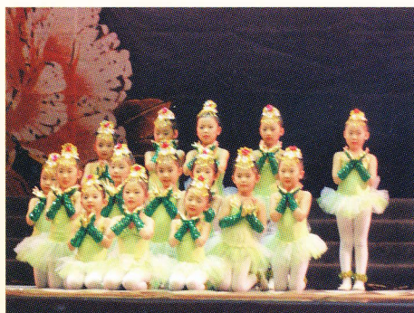
少儿舞蹈《小小茉莉花》 Children's Dance: Little Jasmine