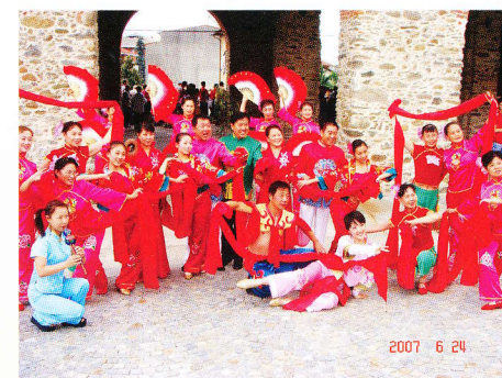
舞蹈《秧歌浪漫曲》 Dance: Yangko Romance