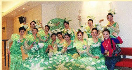
舞蹈《茉莉花》 Dance "Jasmine"