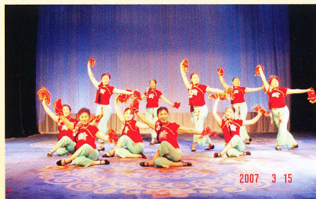
舞蹈《欢庆秧歌》 Dance: Yangko Celebrations