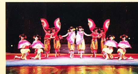
舞蹈《天天好时光》 Dance: Good Time Every Day