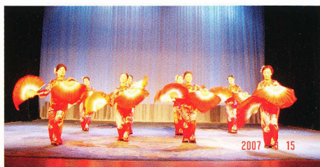
歌舞《开门红》 Songs with Dance: Good New Year's Start

The main programs of China Anshan Folk Art Group