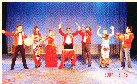
吹打乐表演《欢庆锣鼓》 Performance with wind instruments gongs and drums: Celebration