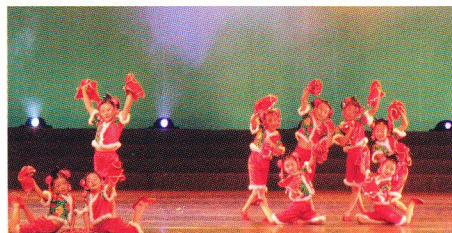
少儿舞蹈《福娃娃》 Children's Dance: Happy Babies