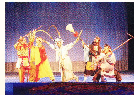
歌舞表演《西游外传》 Dance and songs: Journey to the West